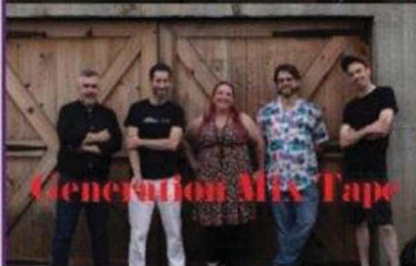
Generation Mix Tape