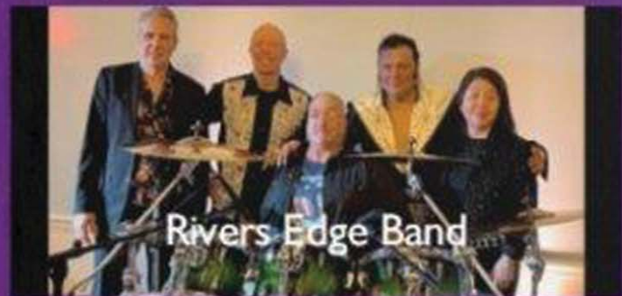
Rivers Edge Band