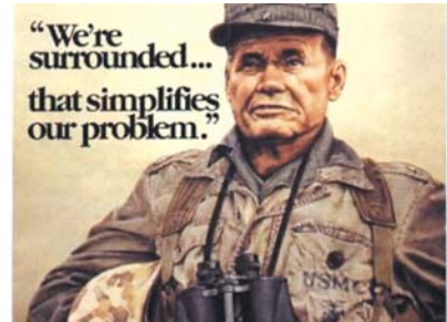
General Lewis B. "Chesty" Puller

1463 I MINNIEVILLE ROAD • DALE CITY, VIRGINIA 22193 • 703.670.4124 vfw1503.org