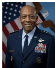
General Charles Q. Brown Jr. Chairman, Joint Chiefs of Staff