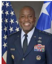
LT General Stacey T. Hawkins Commander Air Force Sustainment Center