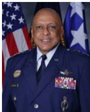
General Anthony J. Cotton Commander, U.S. Strategic Command