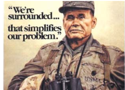
General Lewis B. "Chesty" Puller

1463 I MINNIEVILLE ROAD • DALE CITY, VIRGINIA 22193 • 703.670.4124 vfw1503.org