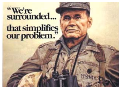
General Lewis B. "Chesty" Puller

14631 MINNIEVILLE ROAD • DALE CITY, VIRGINIA 22193 • 703.670.4124