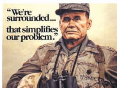
General Lewis B. "Chesty" Puller

14631 MINNIEVILLE ROAD • DALE CITY, VIRGINIA 22193 • 703.670.4124